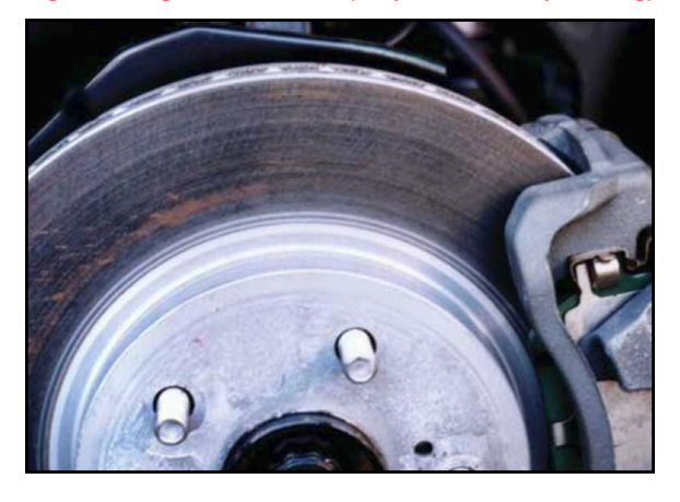
Figure 1. Slight rust on rotor (easy to remove by braking)