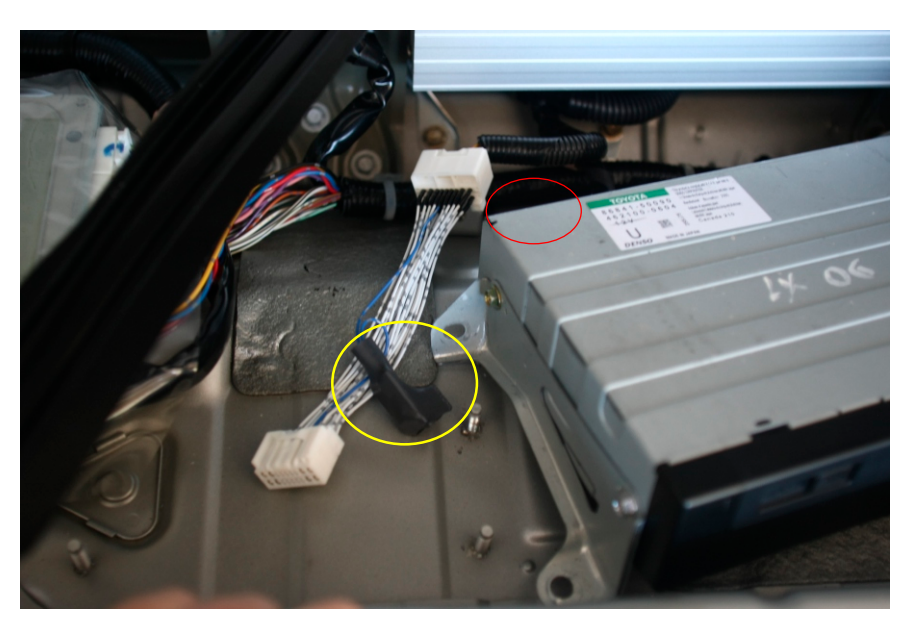
BEAT SONIC MODULAR BYPASS CONNECTOR