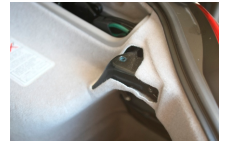
T40 Torx tool need to remove the tonneau receiver. Removing this piece allow you to manipulate the right side garnish piece enough to remove the center section.