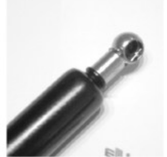
Bottom Strut Socket