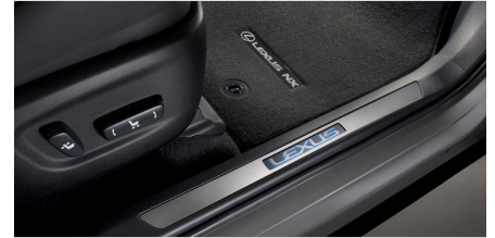
Illuminated Door Sill Protectors $495.00*

Enhance the appearance of your vehicle with this high-strength impact resistant tinted acrylic hood deflector. It's designed for a quality fit and matches the contour of your hood. Aerodynamically designed to deflect airflow over the hood of your vehicle. It helps reduce hood paint chipping from road debris and keeps leading edge of your hood free from insects. Easy to install featuring a 'no-drill' attachment system.