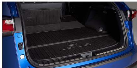
Seatback Cargo Liner $185.00*

Genuine Lexus paint protection film, designed for the hood and front fenders, helps guard your vehicle from weathering, UV radiation and road debris that can chip and scratch the finish. Constructed from durable, nearly invisible thermoplastic urethane, the clear-coated film helps your Lexus maintain a like-new appearance, while allowing you to clean and maintain your vehicle the same as before. Backed by a 7 year limited warranty. At participating dealers only.