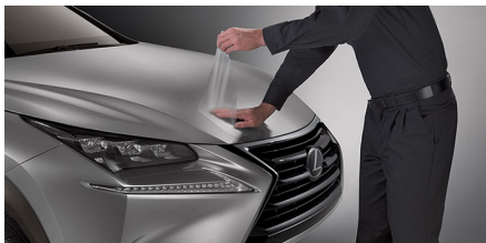
Paint Protection Film $585.00*

Heighten the thrill of stepping into your Lexus with illuminated door sills for the driver and front passenger doors. Precision-contoured to fit the vehicle, the sills feature brushed heavy-gauge stainless steel to help protect against unsightly scuffs, scrapes and scratches. The front door sills feature LED illumination of the Lexus name in glowing white for gas models or hybrid blue for hybrid models whenever the front doors are opened. These illuminated door sill enhancements are designed to meet Lexus' high standards for precision fit and finish, so you can be assured of long-lasting beauty and durability.