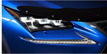
Hood Deflector $195.00*

Custom designed for your Lexus providing 400 watts of heating power. Provides easy cold weather starts reducing engine wear. Provides faster interior warm-up. Includes a 'strain relief' electrical cord.