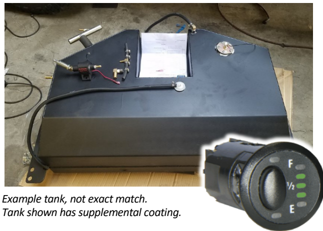
Example tank, not exact match. Tank shown has supplemental coating.

This auxiliary tank kit from Long Range Automotive of Melbourne, Australia was developed to meet the needs of North American vehicle owners. The goal? To provide additional fuel capacity from a high-quality aluminized steel replacement tank that integrates seamlessly with factory fuel systems and emission controls in North American vehicles.