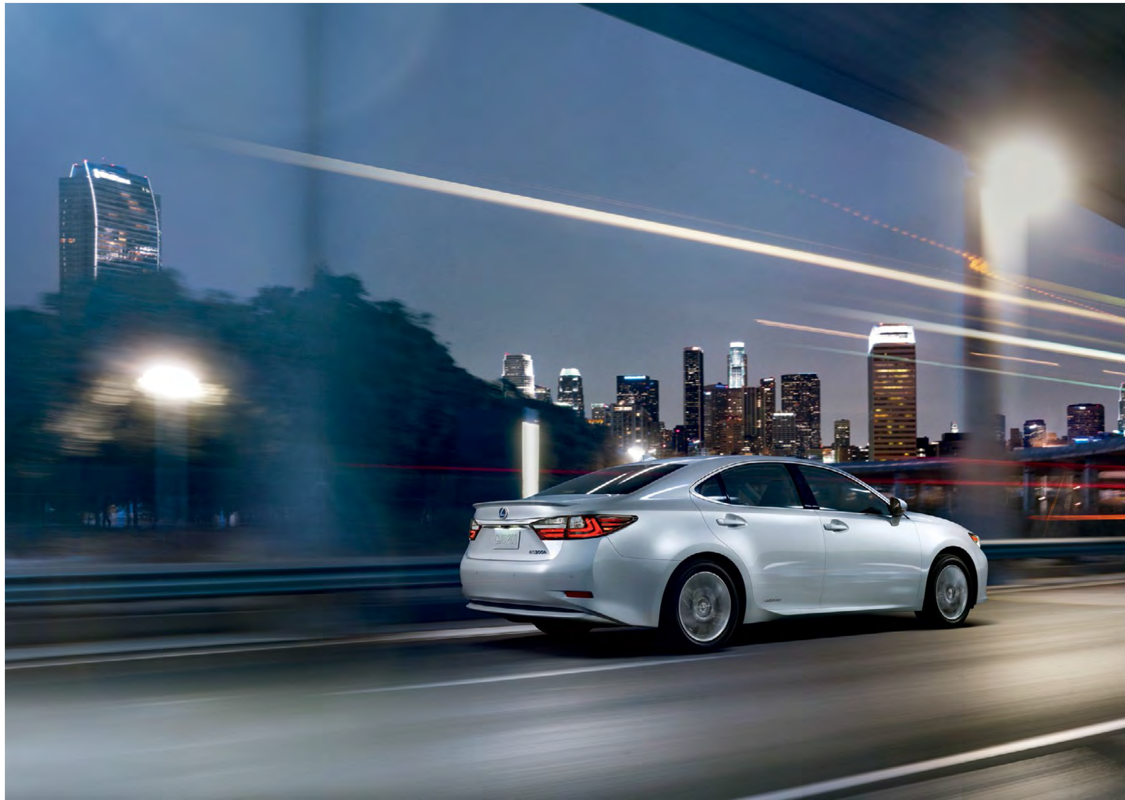
Beyond its sleek, concealed-exhaust design, the ES Hybrid sets itself apart with a stunning 40-MPG combined fuel-economy rating. 2